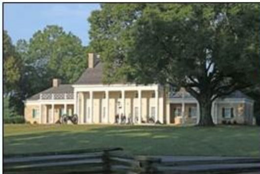
The Chickamauga Battlefield Tour

Ballots were collected at December's Dinner Meeting. The following three activities received the most votes by members. Activities dates will be posted in the newsletter. Tentatively Springtime would be for the Baseball outing, Mid-summer the Battlefield tour and Fall for the Train ride.