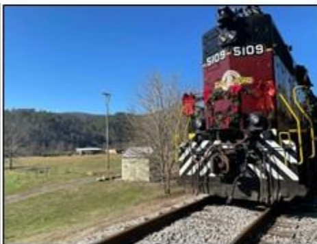
Train Ride through the famous Hiwassee Loop