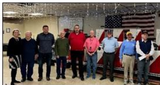
The Executive Board of the Chattanooga Area Veterans Council