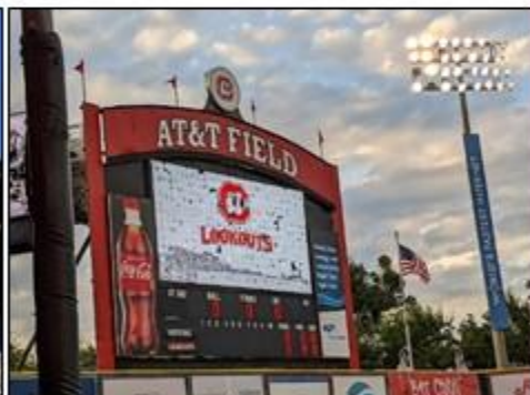
Lookout's Baseball Outing.